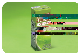
Cartons: Milk cartons, juice boxes, and soup cartons