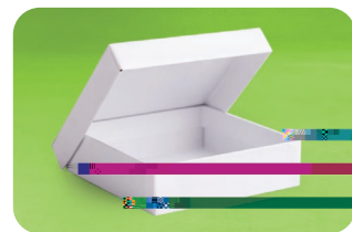
Cardboard and boxboard: Cereal boxes, cardboard boxes, and cardboard tubes